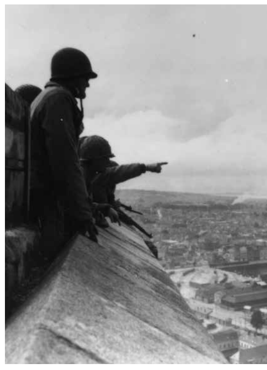
American soldiers look towards Cherbourg [The arsenal burns]. 1944.